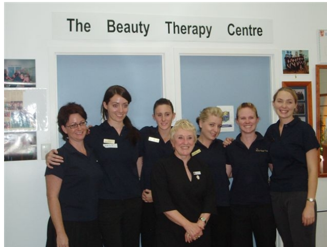
Part of our 2006 Diploma class with AABth National Assessor